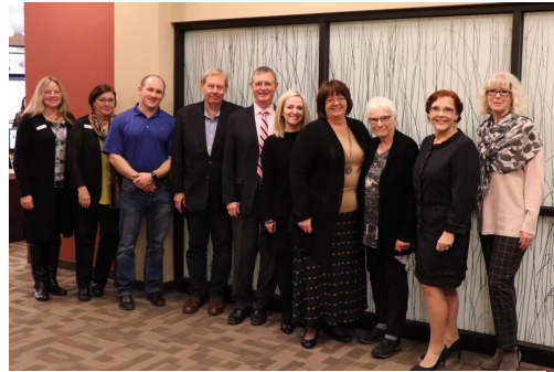
Thank you, MCF Board

Thank you for all you do in support of our mission!